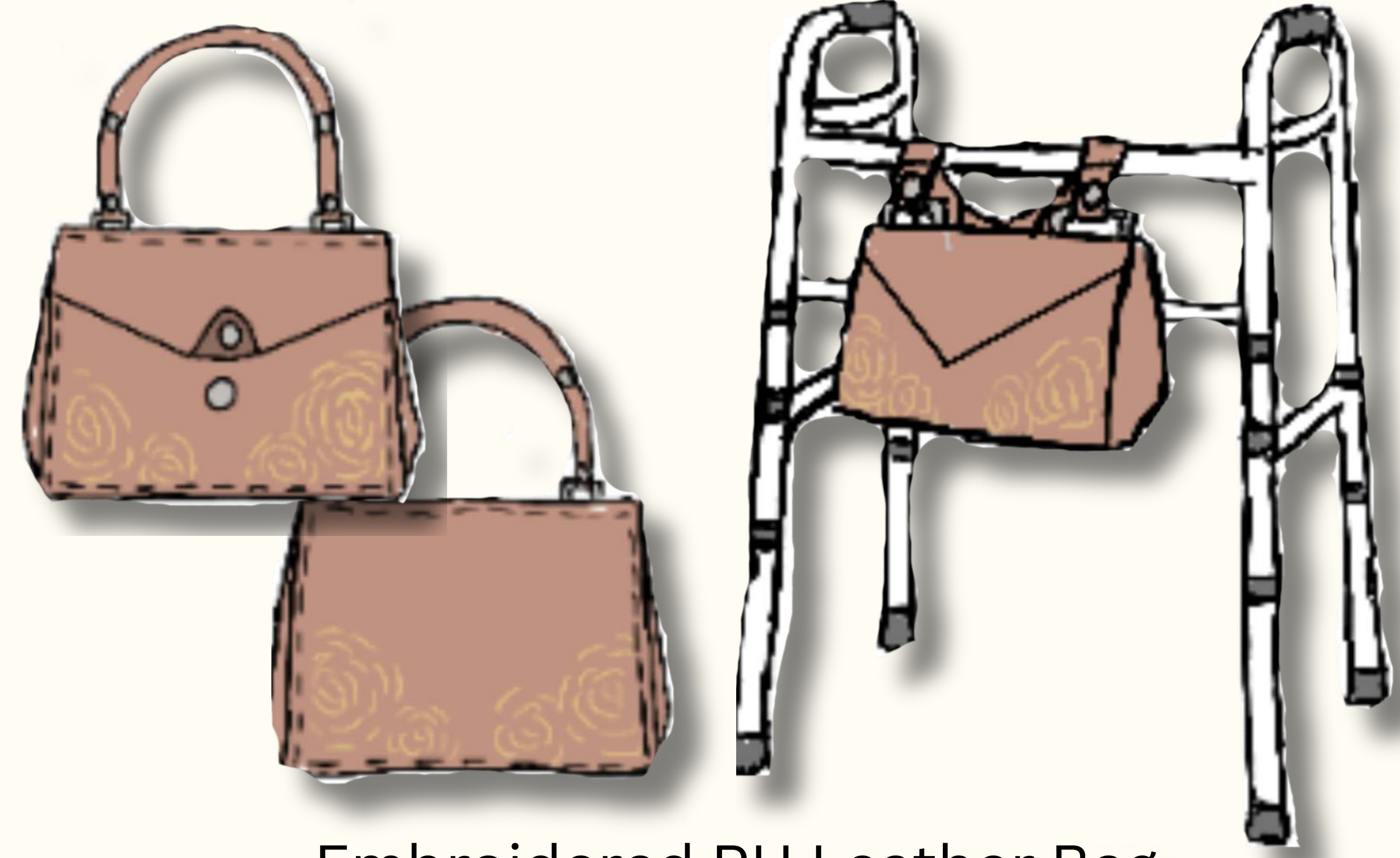
Embroidered PU Leather Bag with Metal Snaps for Walcker Attachment

Golden Girl is an adaptive senior clothing line for Nursing Home to Public in the Winter season . The garments offer a wide range of accommodations such as magnetic snaps, front opening closures, elastic waistbands, and bags that can be securely hung onto walkers. When going out for a walk or visiting family, Golden Girl makes sure that seniors have the option of going out or being active even in the winter season.