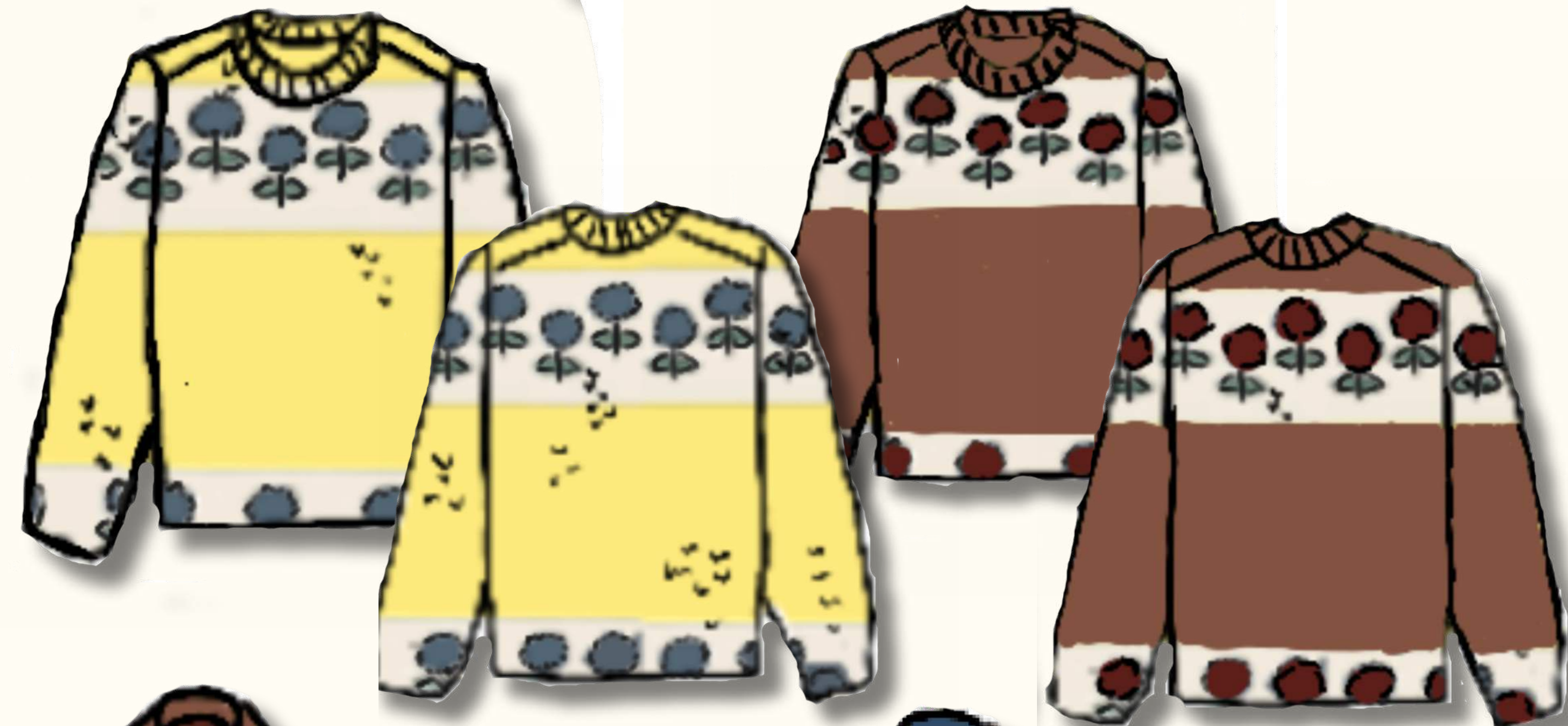
Merino Wool Intarsia Knit Sweater