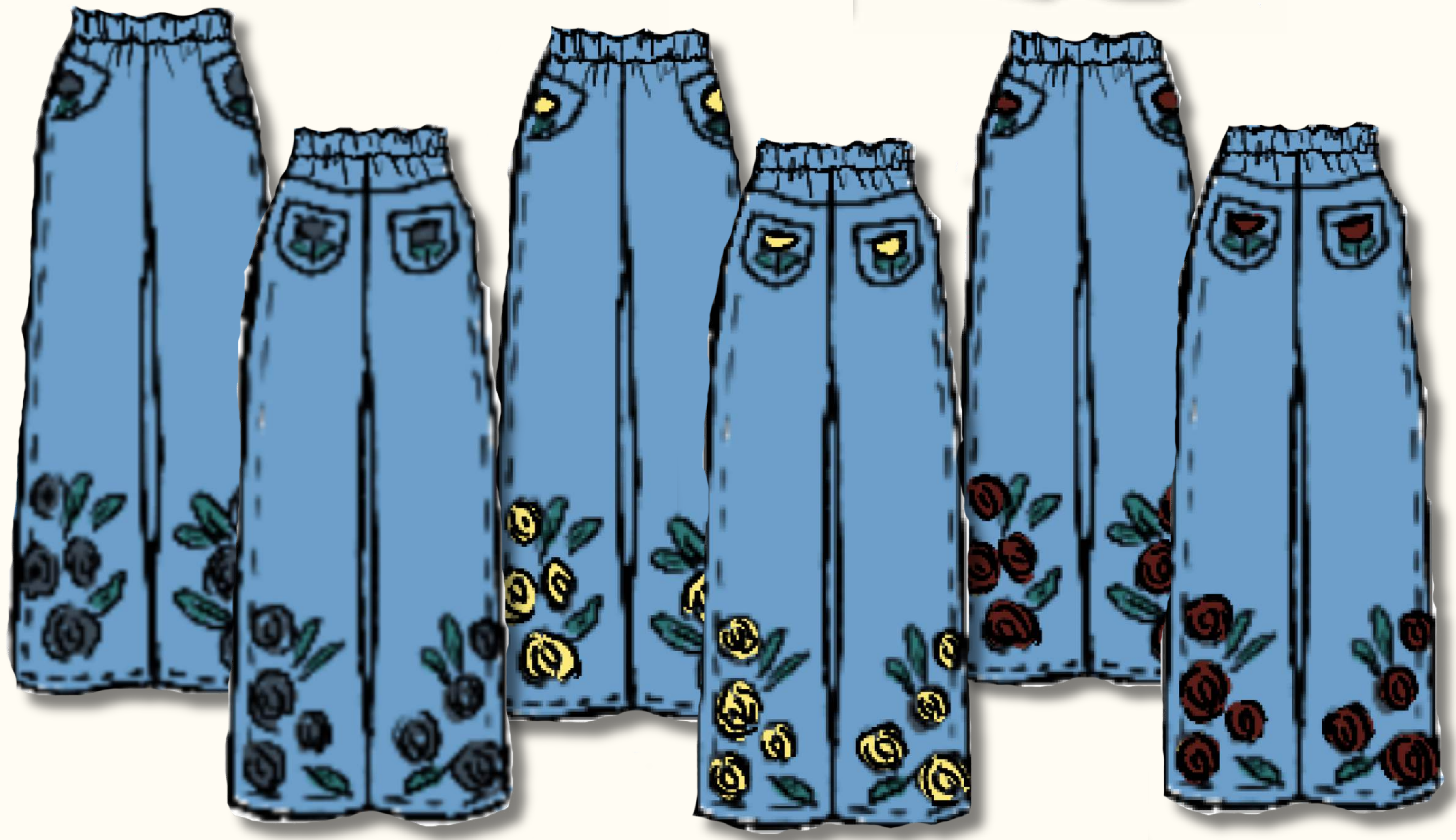
Knit Denim Elastic Waistband Jeans