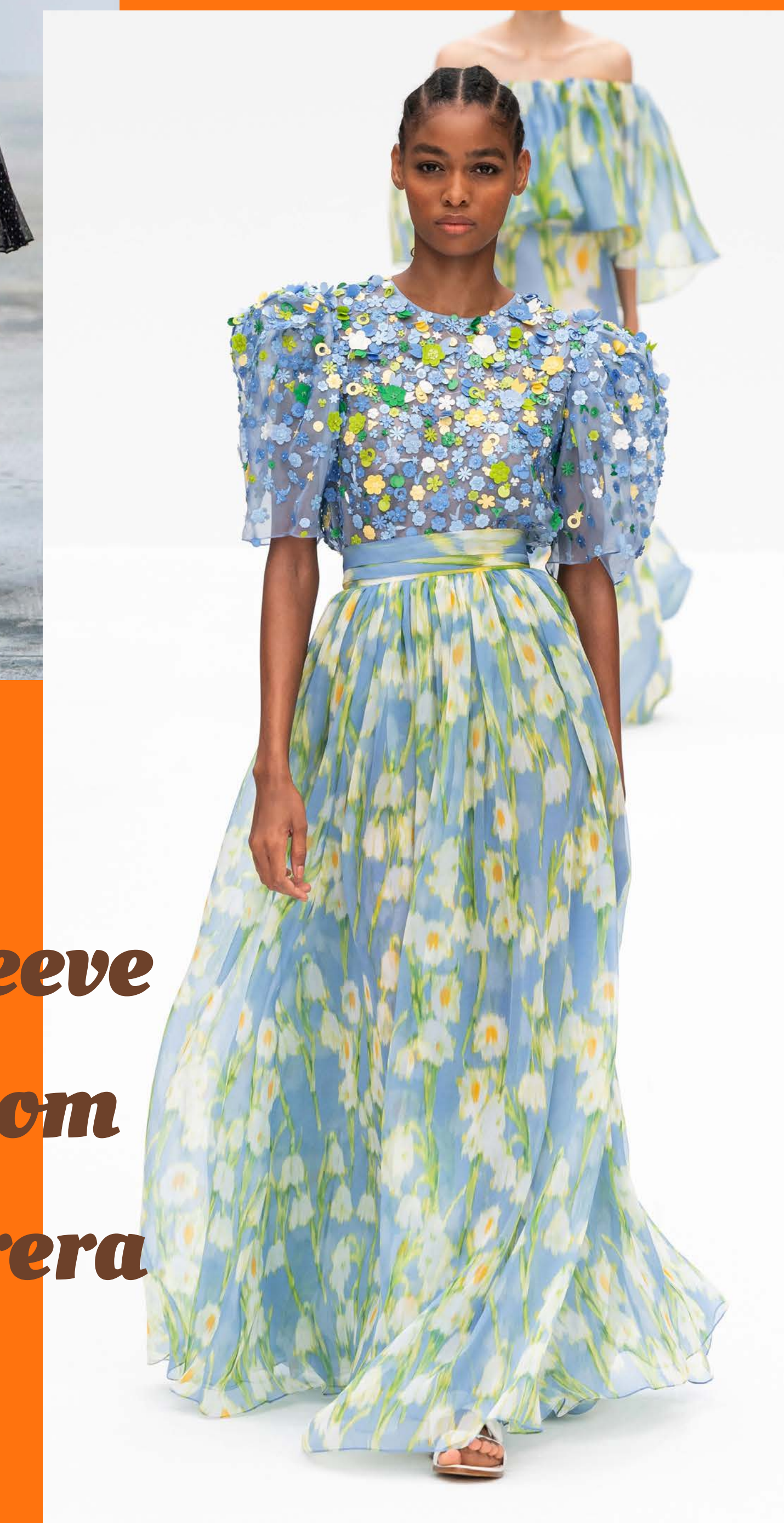
Interesting sleeve silhouettes from Carolina Herrera S/S 2020