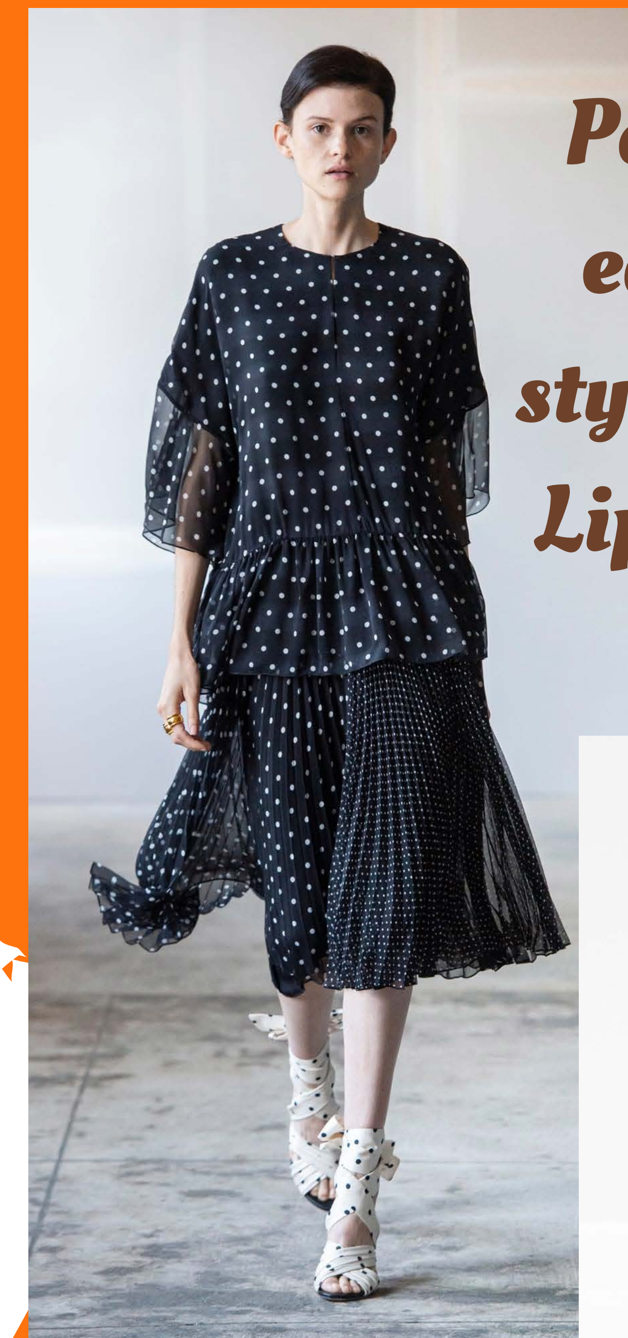
Polka dots and easy feminine styles from Adam Lippes S/S 2020