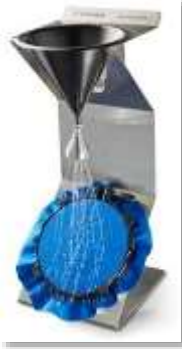
AATCC Test Method 22 Water Repellency: Spray Test