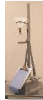
AATCC Test Method 42 Water Resistance: Impact Penetration