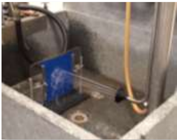
AATCC Test Method 35 Water Resistance: Rain Test