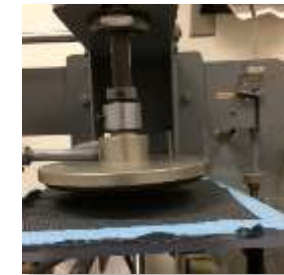
AATCC Test Method 208 Water Resistance: Hydrostatic Pressure Test Using a Restraint