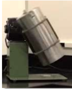
AATCC Test Method 70 Water Repellency: Tumble Jar Dynamic Absorption